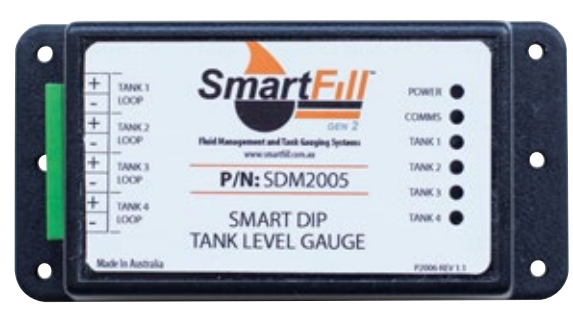
The SmartDip module

SmartDip monitors up to four tanks. It is suitable for most non-flammable liquids such as diesel, with densities ranging from 0.500 to 60.